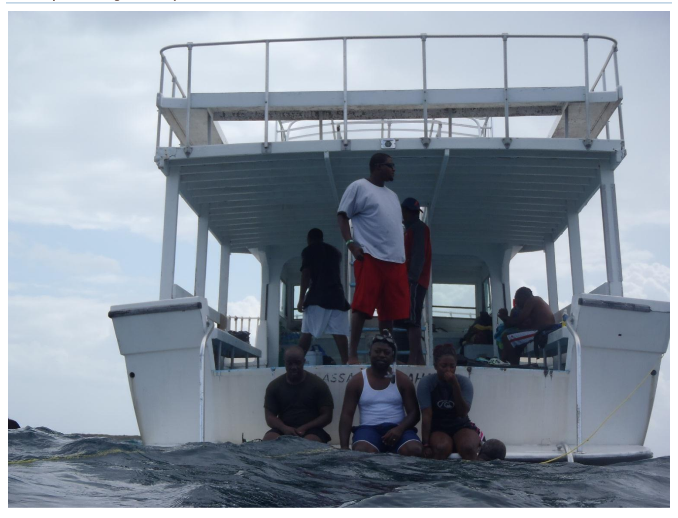
FIGURE 7 SHOWS THE FORUM PARTICIPANTS AFTER THE VISIT TO THE PELICAN CAYS LAND & SEA PARK.