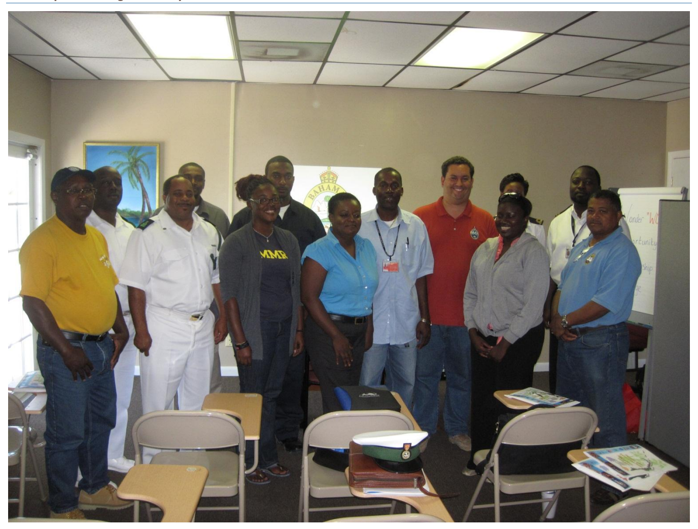
FIGURE 5 SHOWS A GROUP SHOT OF PARTICIPANTS REPRESENTING A NUMBER OF LOCAL STAKEHOLDERS FROM ENFORCEMENT OFFICERS TO MEDIA AND TOURISM