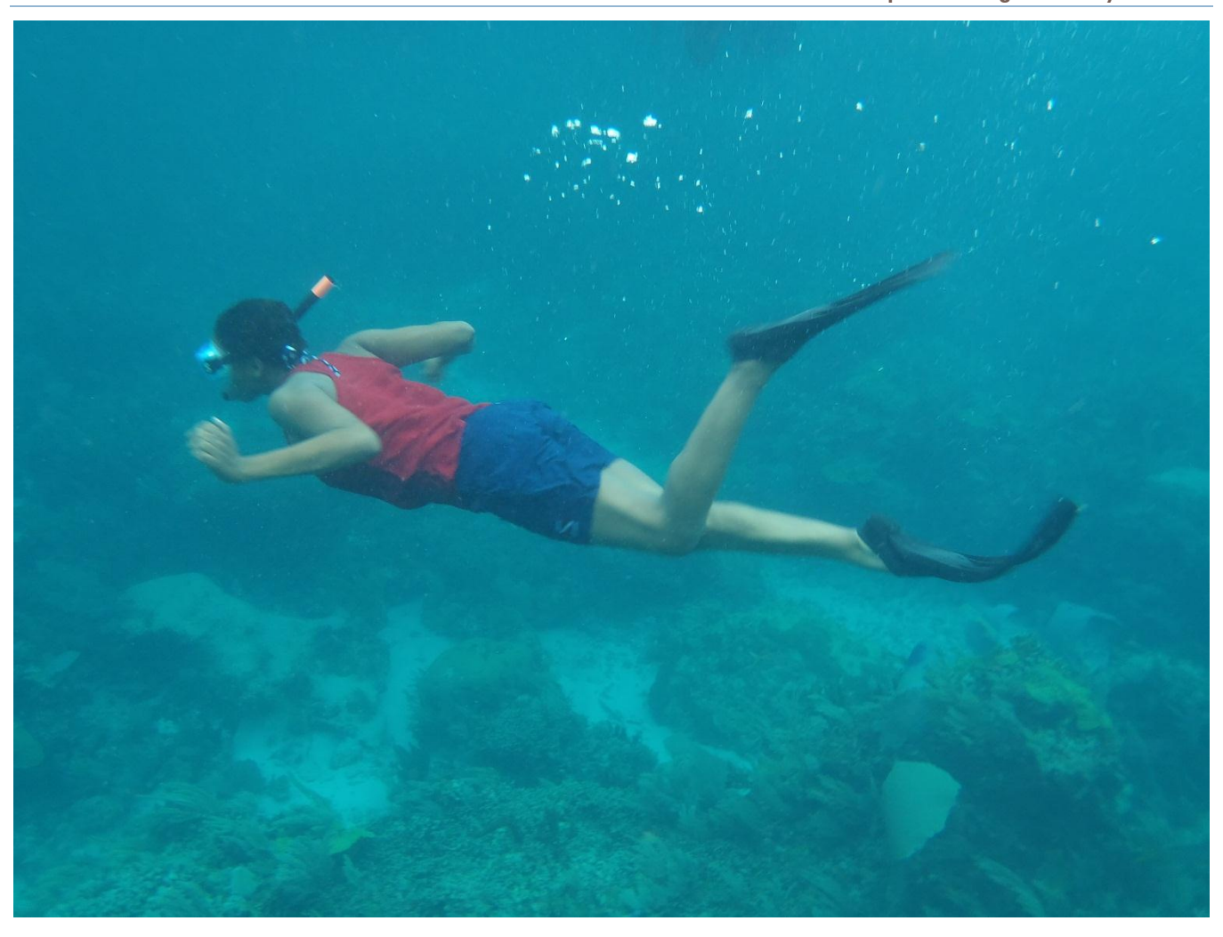
FIGURE 6 SHOWS A REPRESENTATIVE OF THE CUSTOMS DEPARTMENT SNORKELING AT THE PELICAN CAYS LAND AND SEA PARK