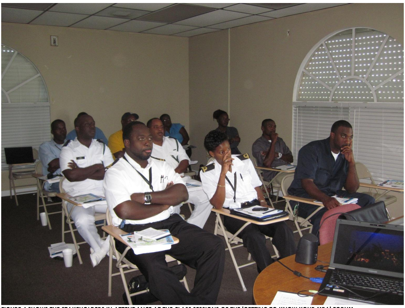
FIGURE 4 SHOWS THE STAKEHOLDERS IN ATTENDANCE AT THE CLASS SESSIONS OF THE 'GETTING TO KNOW YOUR MPA' FORUM